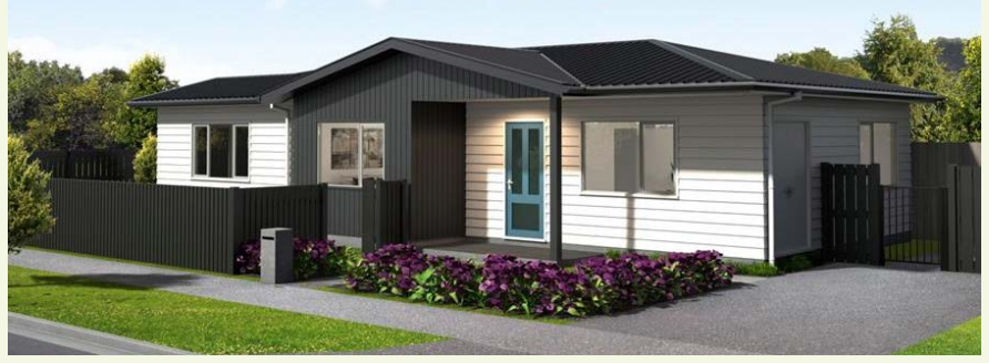
A render of a three-bedroom Kauri Landing home

Another recent release of 50 KiwiBuild homes at Kauri Landing went to ballot after a flood of interest followed the sales announcement. All these properties are currently under offer after the ballot closed on 4 December.