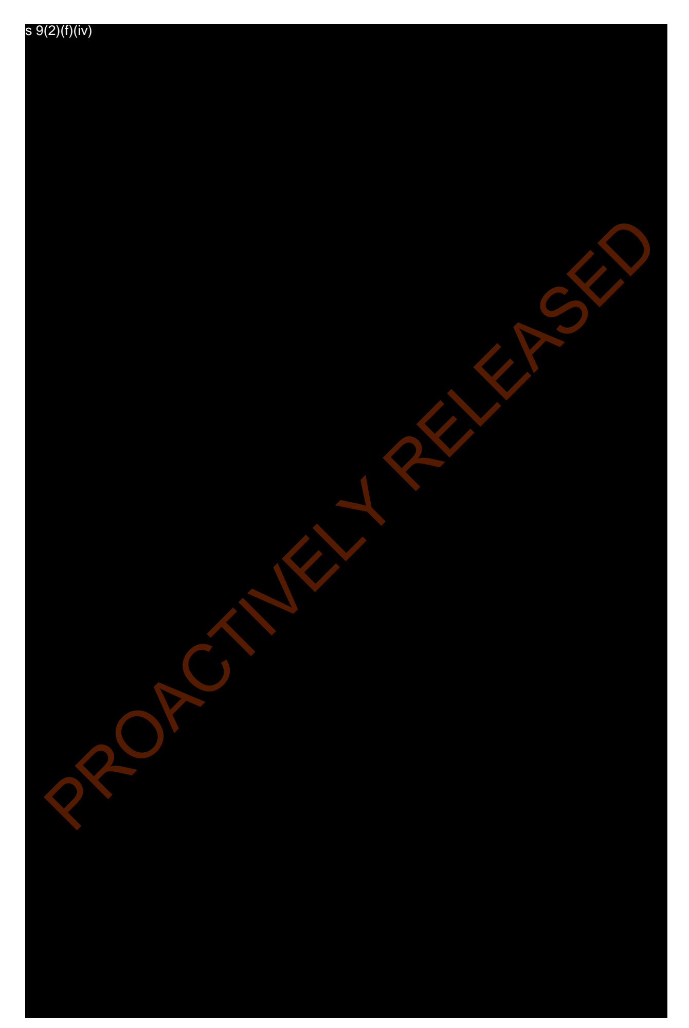
BN 21 031 - Estimated impact of COVID-19