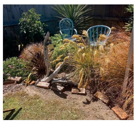
Hampshire Street, Aranui - Pam.