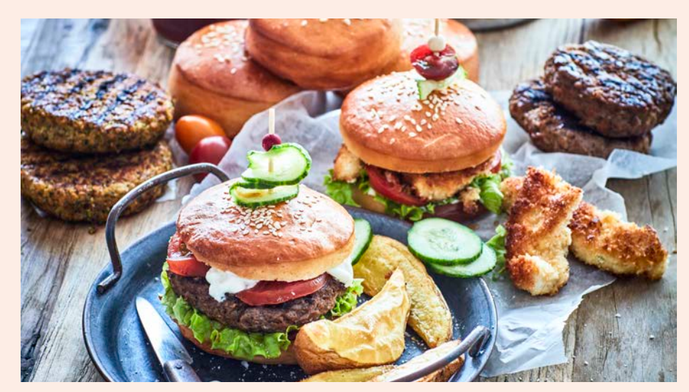
Recipes and photo supplied by Sophie Gray