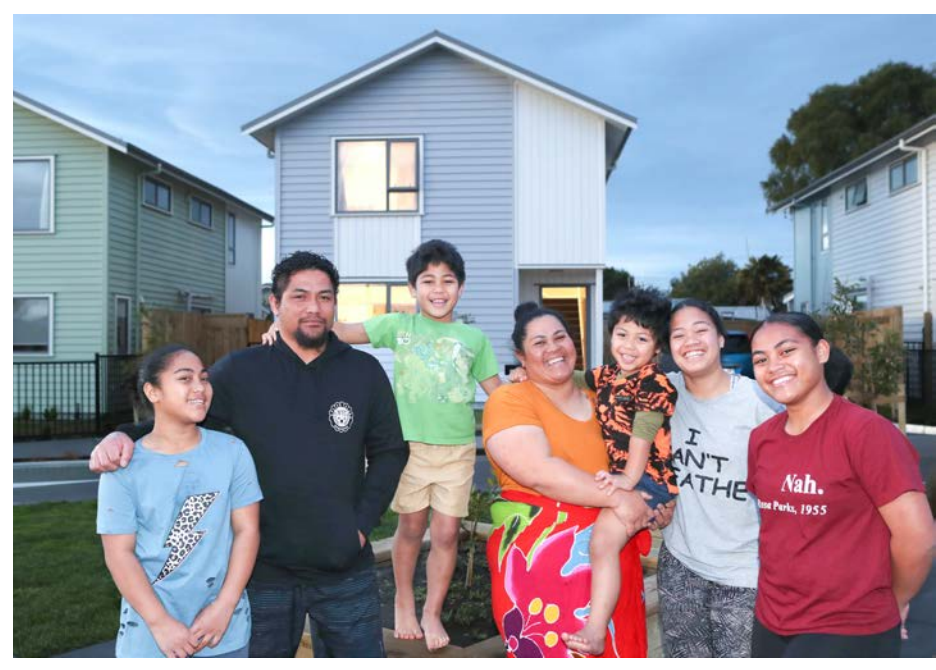
The Tuu whānau in front of their new home in the new Kauri Place development