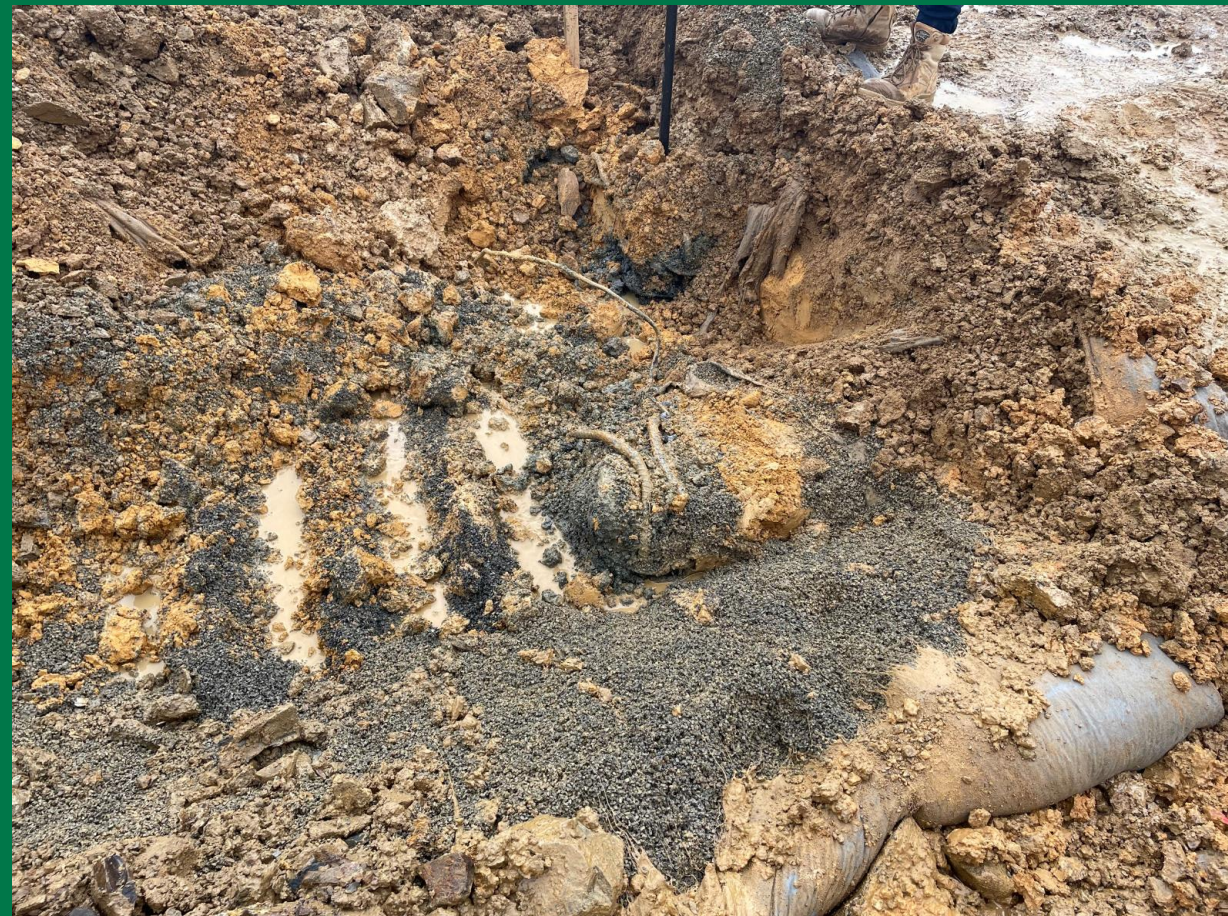
Existing piles explored at block B