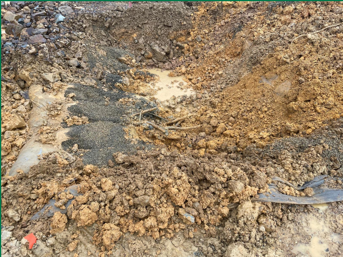
Existing piles at block A