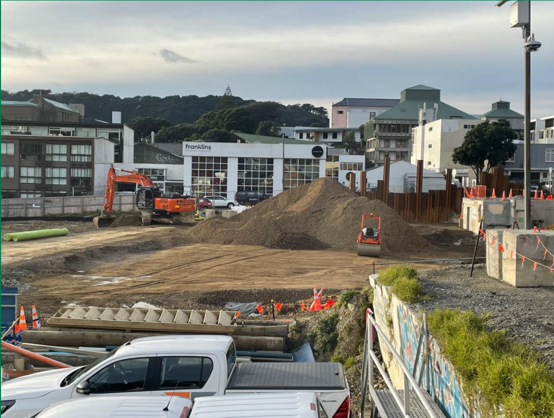
Installation of piling platform in progress for blocks A&B