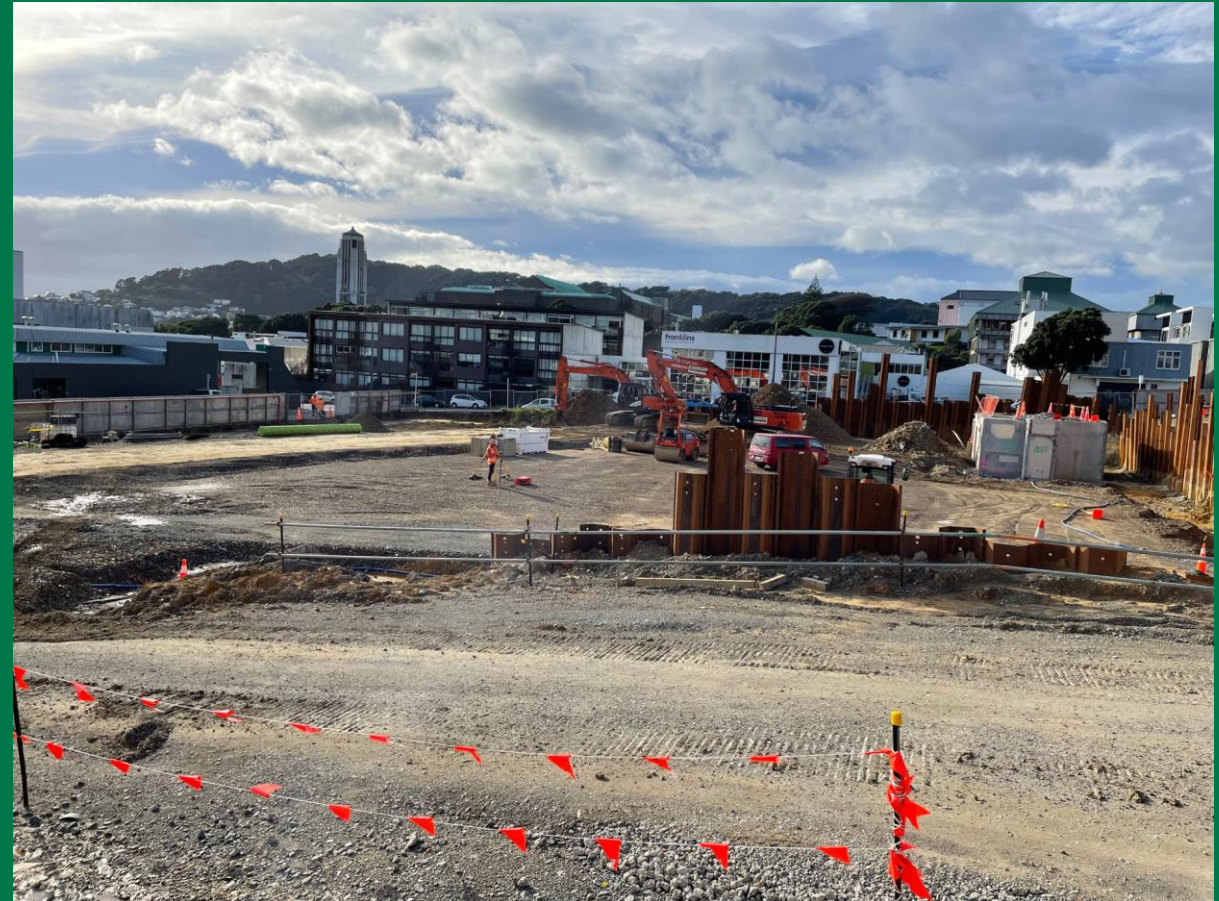
Piling platform for blocks A, B, near completion to proposed level