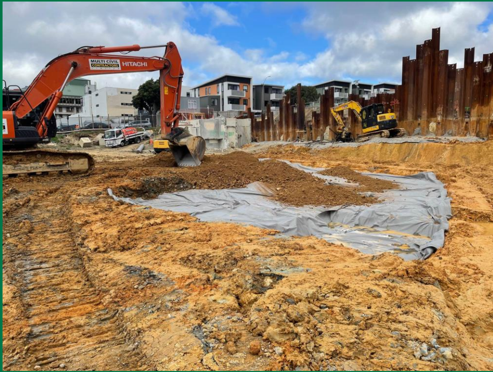
Replacing the soil having completed works in the block X area