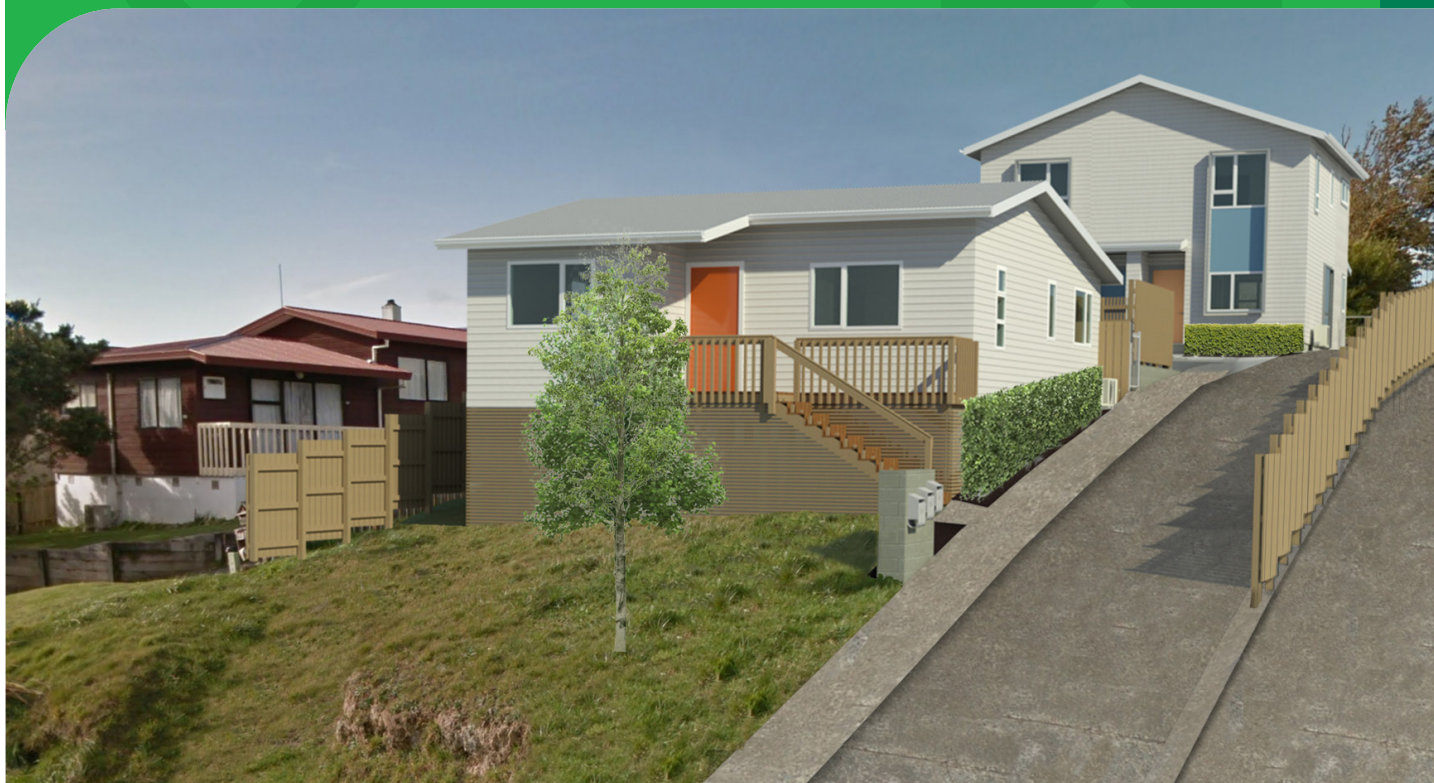
Proposed design for new homes at 35 Bould Street

To help meet the need for housing in Johnsonville, Kāinga Ora - Homes and Communities is looking at building new warmer, drier homes in your neighbourhood.