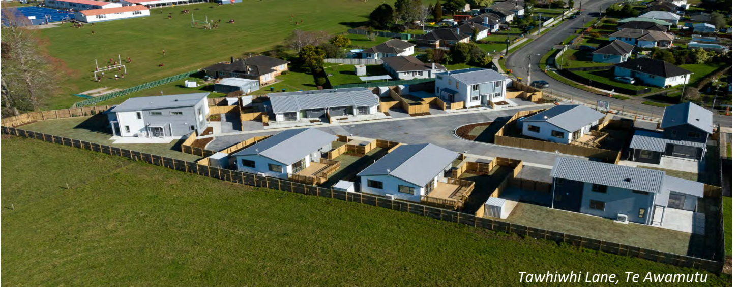
Tawhiwhi Lane, Te Awamutu