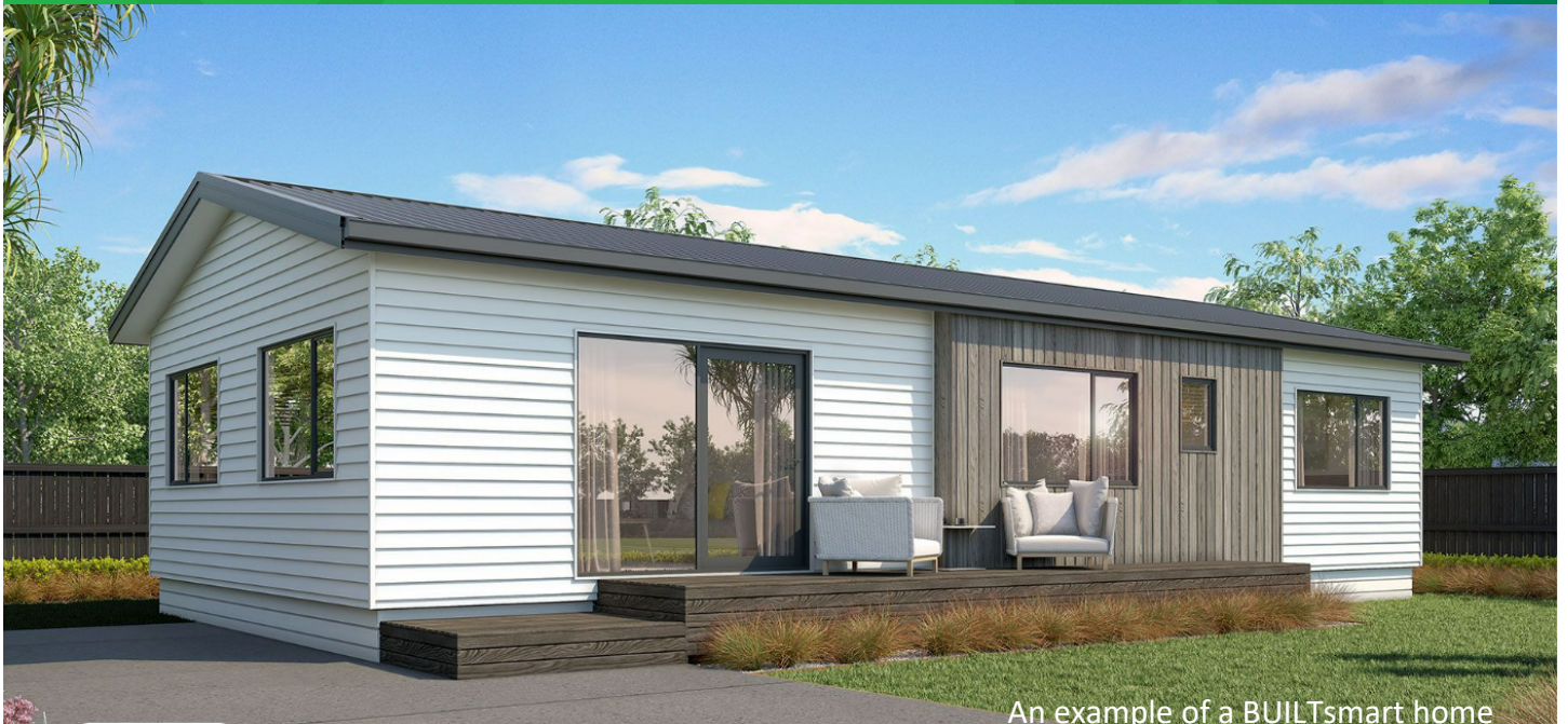
An example of a BUILTsmart home