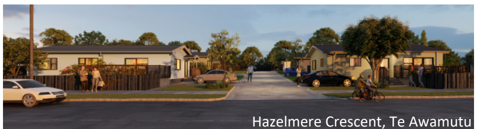
Hazelmere Crescent, Te Awamutu

Kāinga Ora staff remain available to talk with people about any feedback they have.