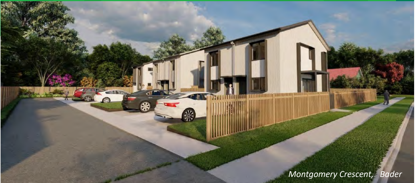
Montgomery Crescent, Bader