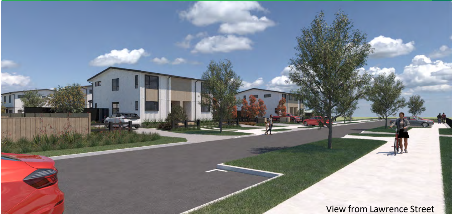
View from Lawrence Street