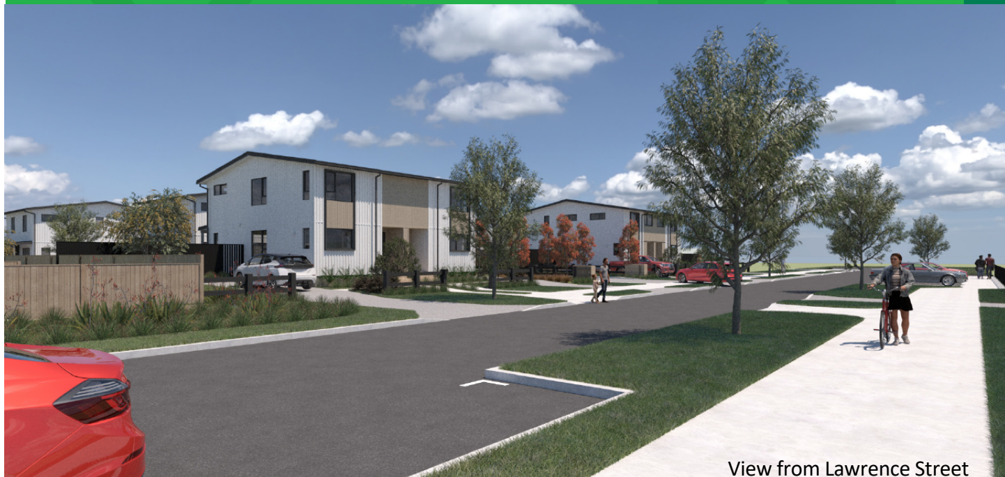
View from Lawrence Street