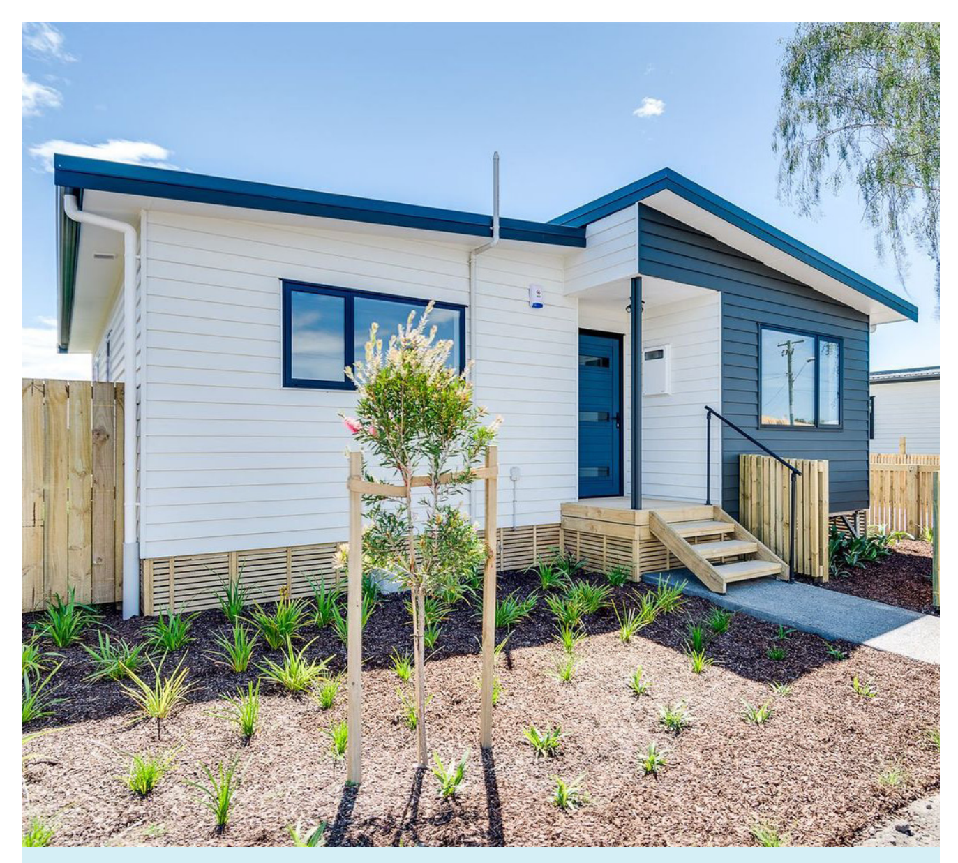
Image: Geddies Ave - KiwiBuild houses in Napier - build by Kāinga Ora.

All homes will be warm, dry and fit-for-purpose homes.