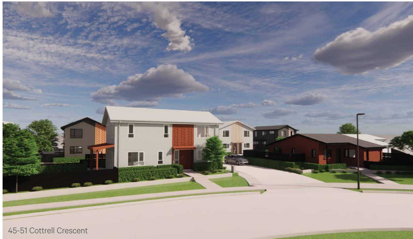
45-51 Cottrell Crescent