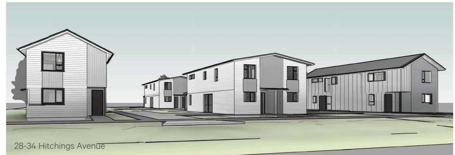
28-34 Hitchings Avenue