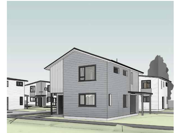
28-34 Hitchings Avenue