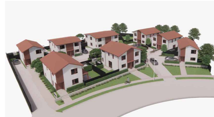
11-19 Cottrell Crescent

The plans cover items like the hours during which work can be carried out, where contractors can park their vehicles and the control of dust and noise. When the construction phase begins, building activity is expected to take place between the hours of 7am and 6pm Monday to Friday and 8am to 5pm on Saturdays, but not on Sundays and public holidays.