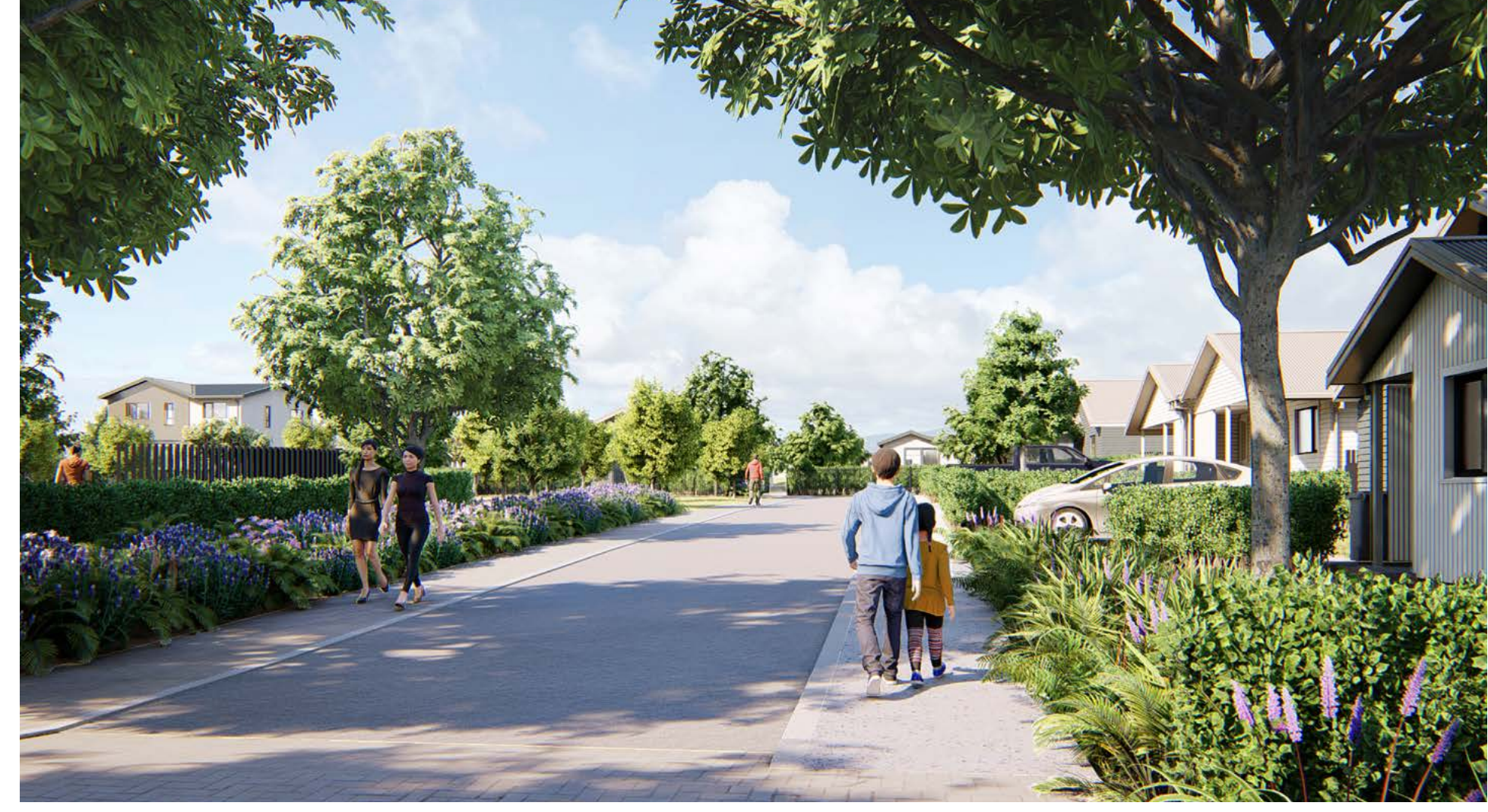
View of completed homes, opposite park