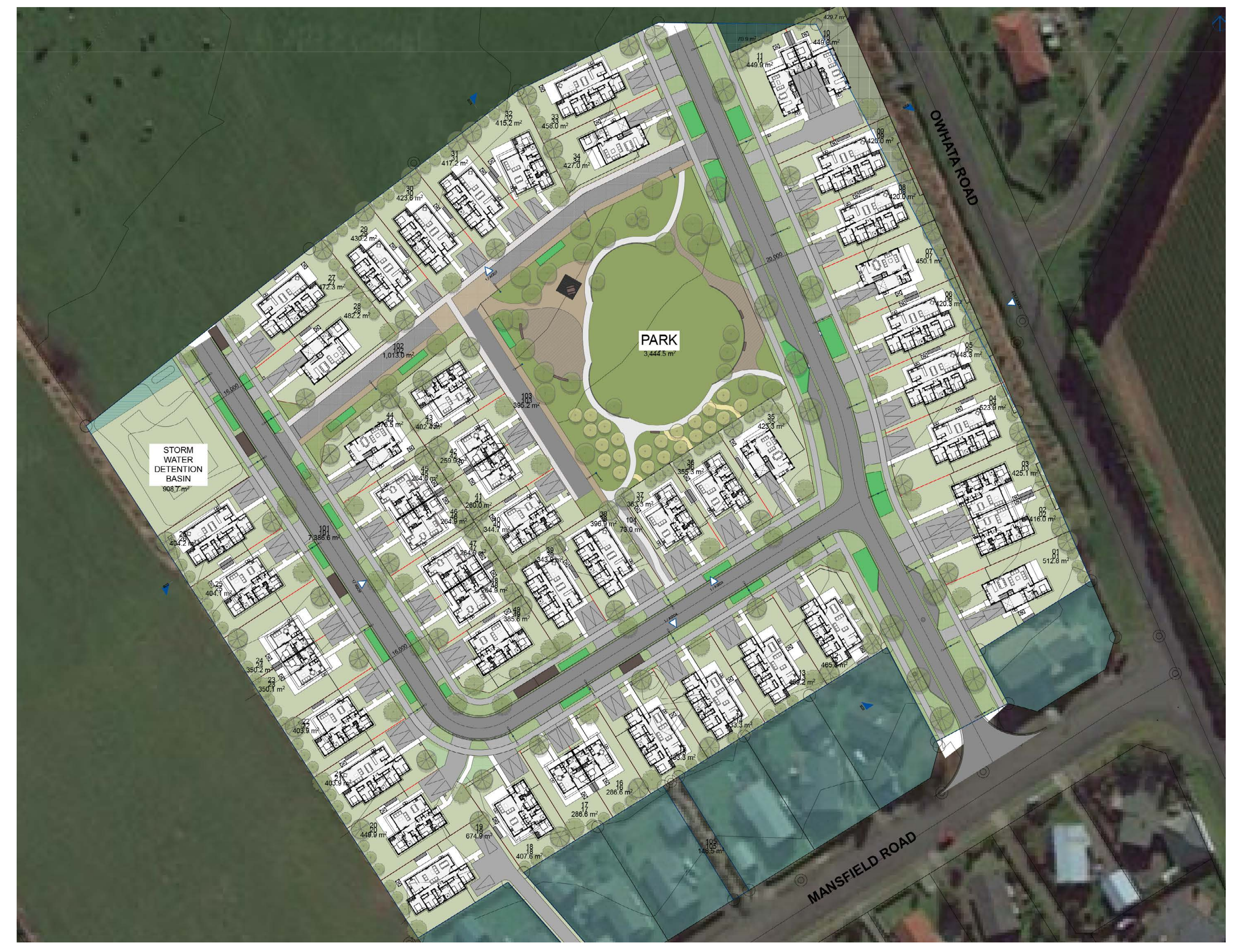
Site plan, showing park, roading and landscaping