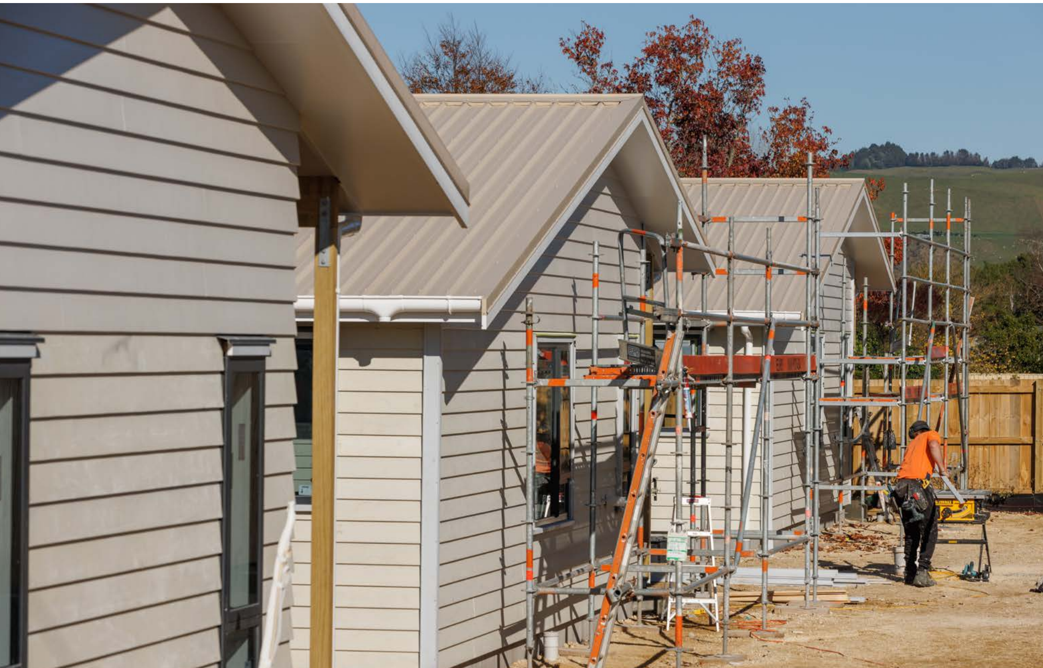
Under construction homes in Rotorua