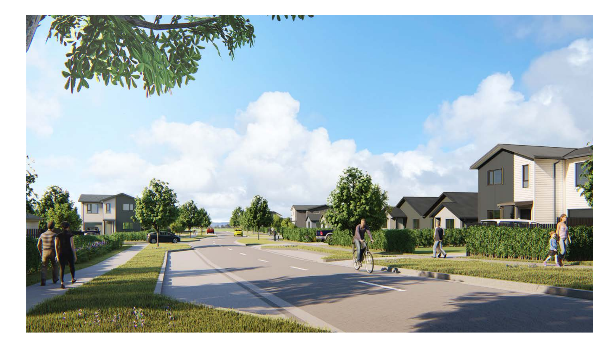
Completed homes, looking north from Mansfield Road entrance