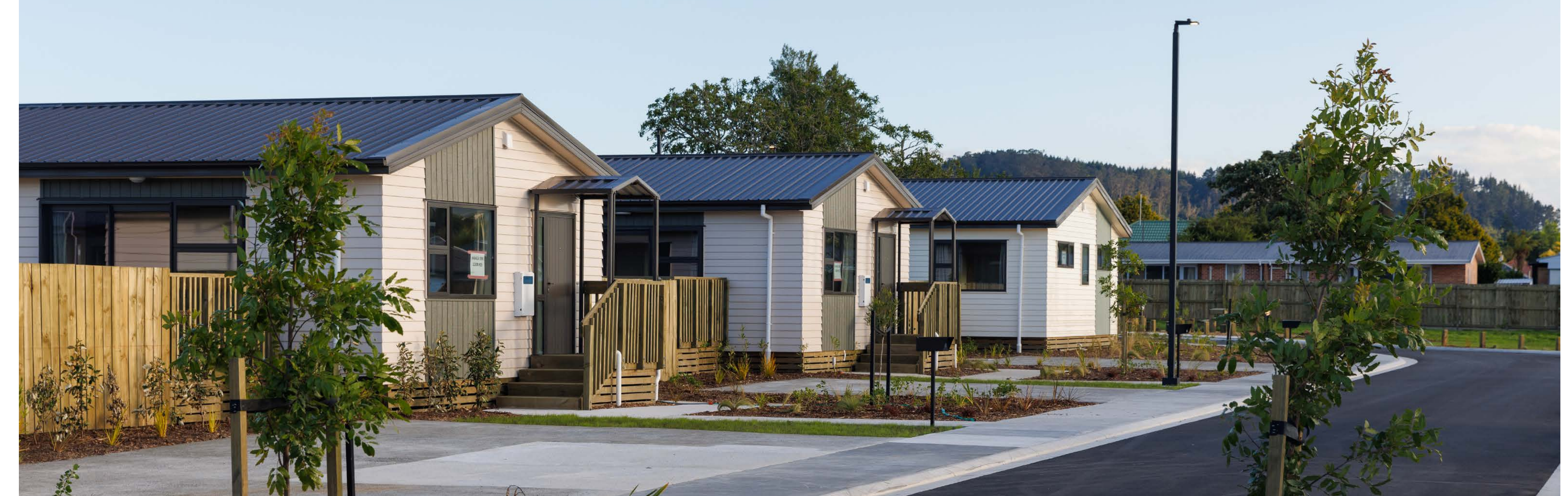
New homes at Ranolf Street / Malfroy Road