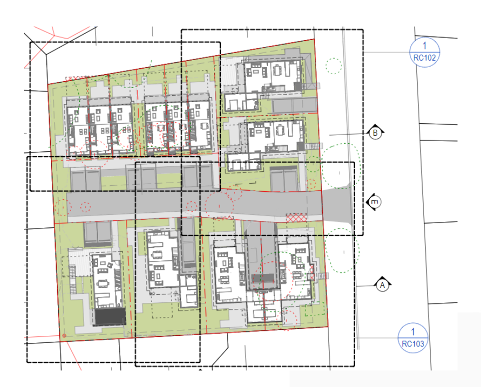
Figure 2: Landscape Plan