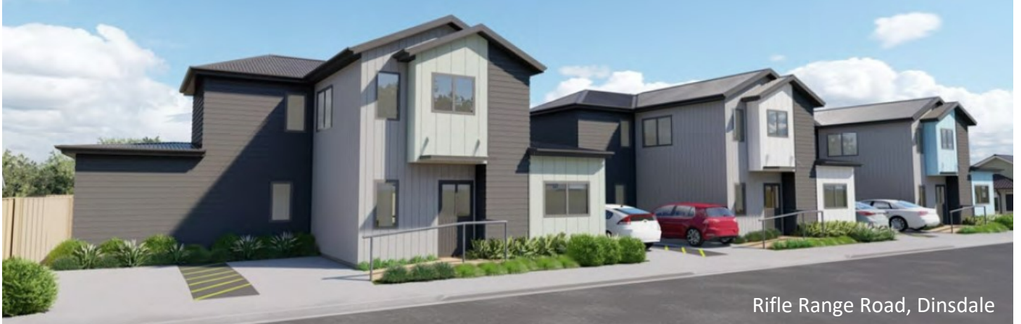
Rifle Range Road, Dinsdale