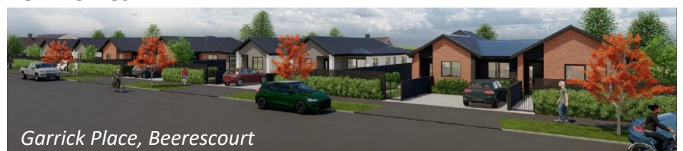
Garrick Place, Beerescourt