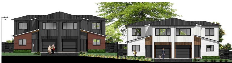
English Street, St Andrews

Retrofitting a home takes around three to four months. We have started a programme of retrofitting homes in =