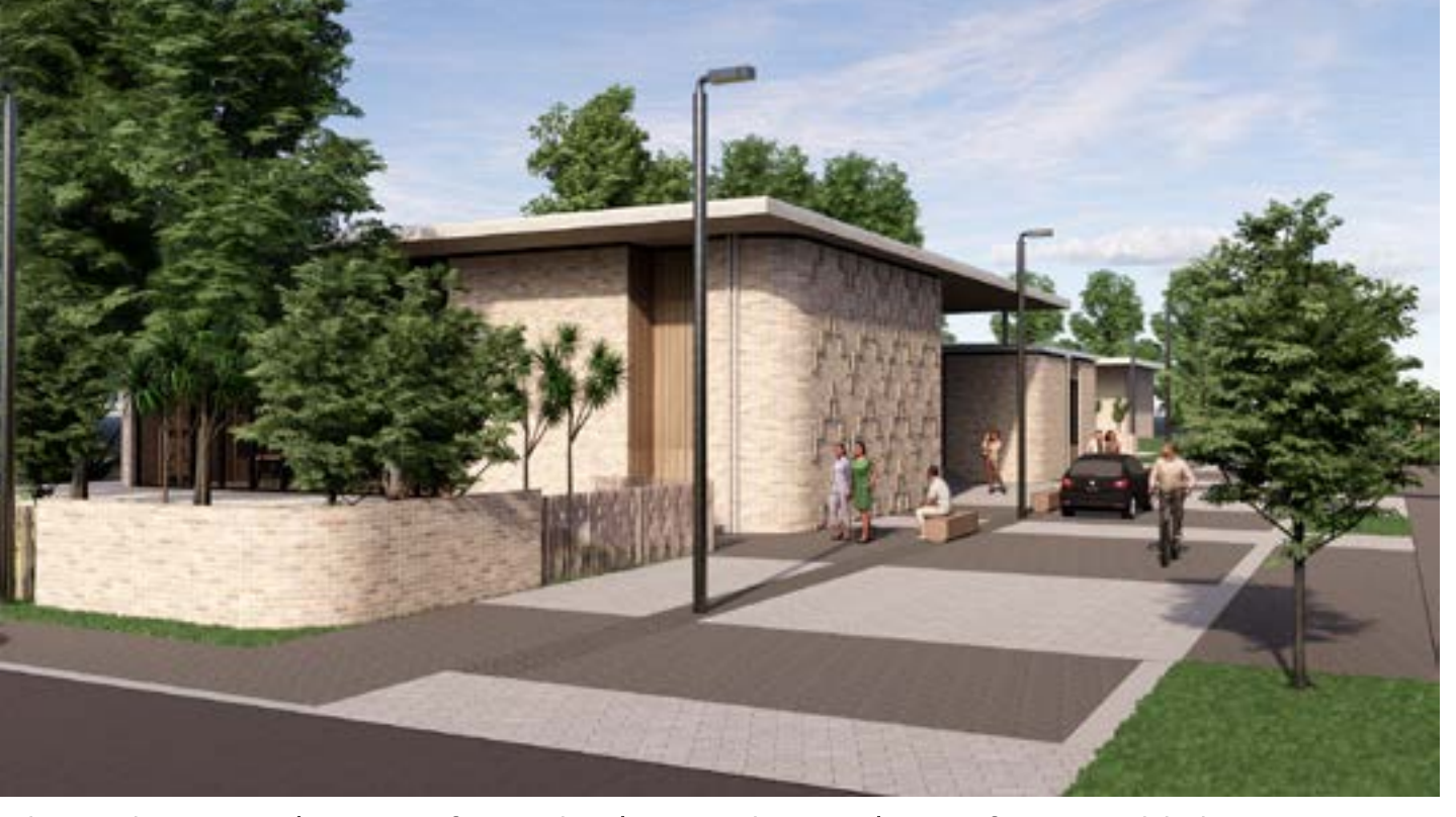
Shared internal street for vehicles and people on foot and bikes