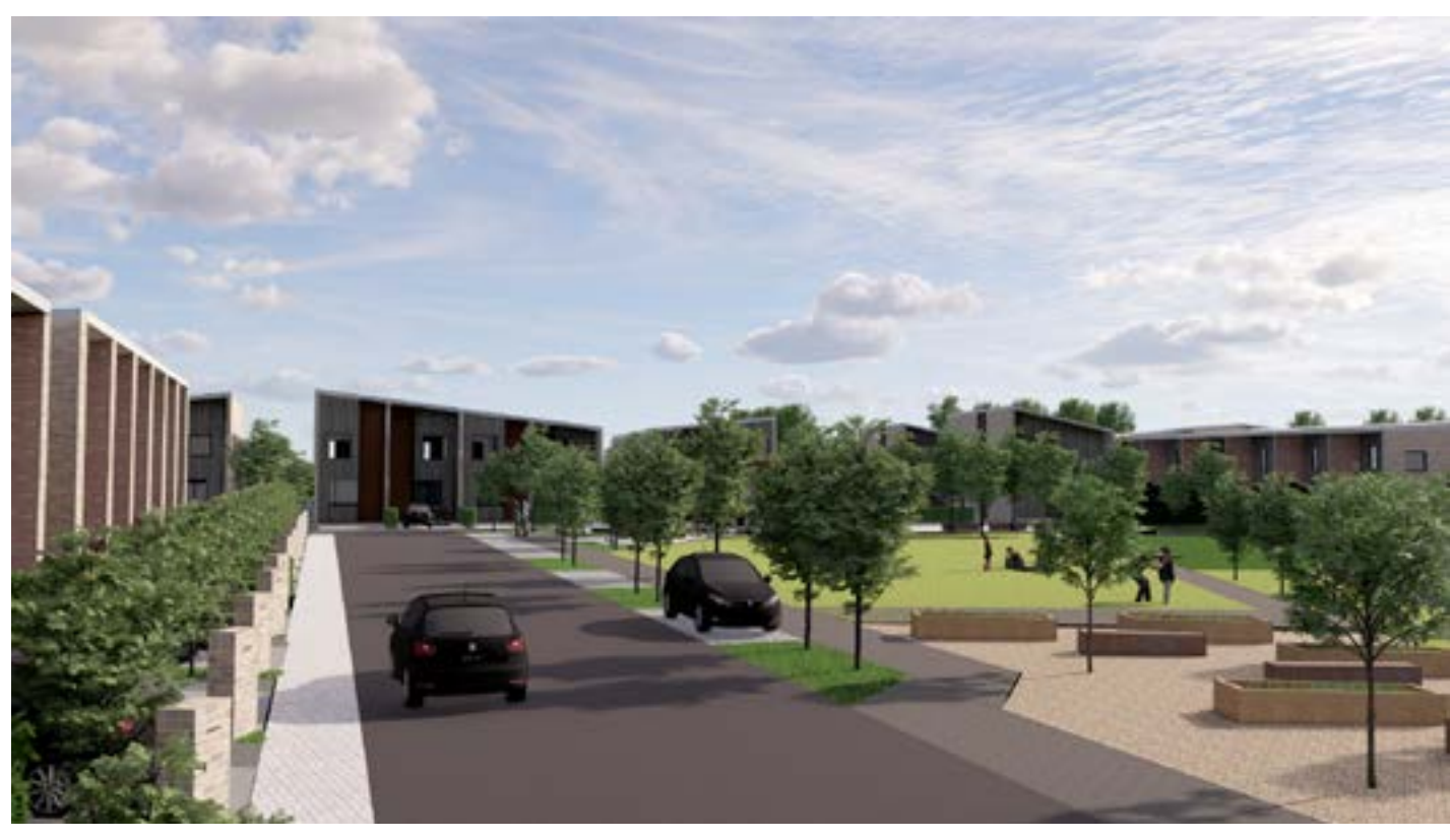
Internal park with homes surrounding