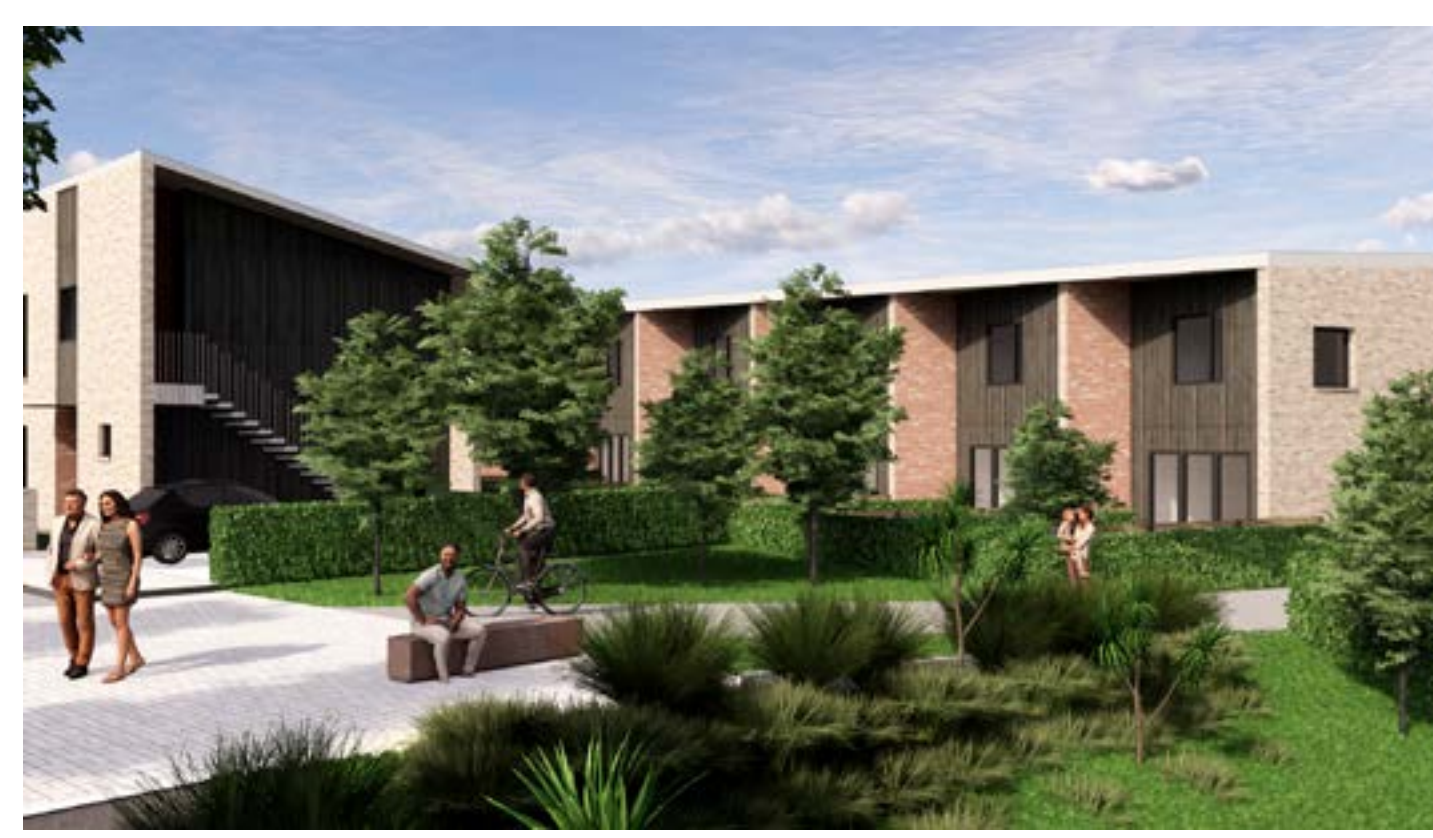
Two-bedroom terrace homes