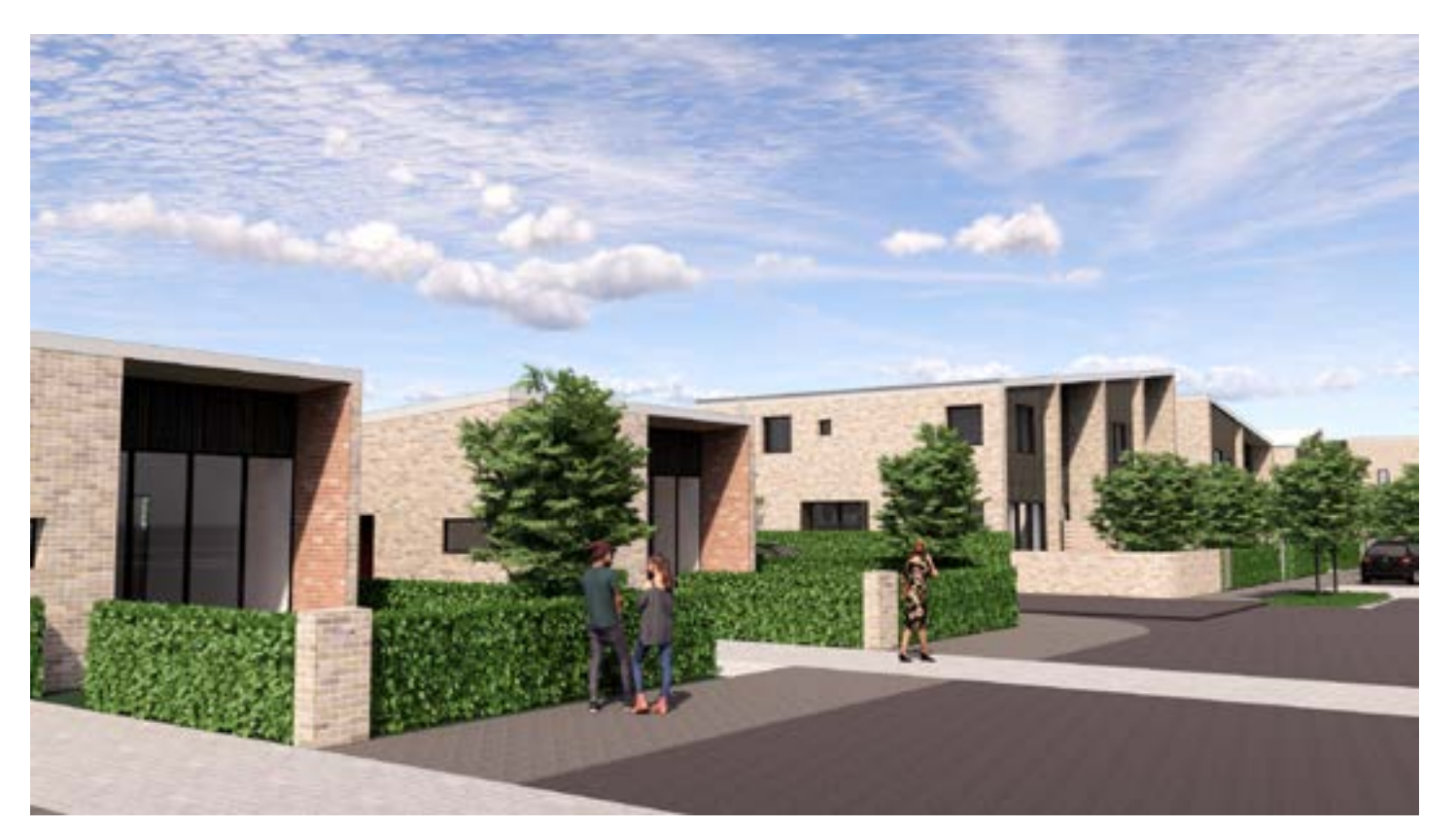
3 one-storey kaumaatua homes