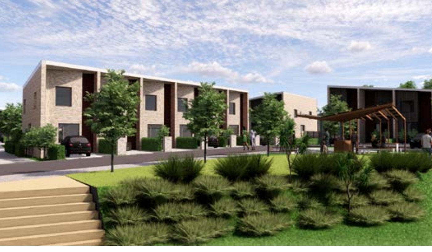
View from park to two-bedroom terrace homes